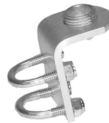
274-MMB (optional mirror mount bracket)